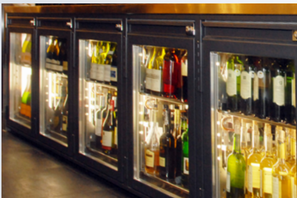
Different decorations and structures as well as powder coating in RAL colours possible.