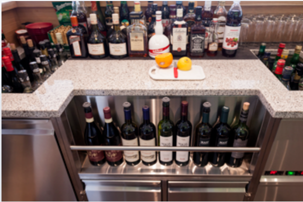
Cocktail station with railing, refrigerated ice tray and pressure rinser for glasses for easy handling.

We are constantly working on making our products even better. That is why we developed an efficient refrigeration system with an optimum evaporator position and improved airflow. That way, cold air flows around your products uniformly, and the loss of coldness when the doors are opened and during loading is minimised.