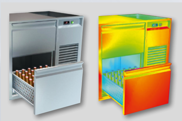
Perfect and uniform cooling for the different beverages.