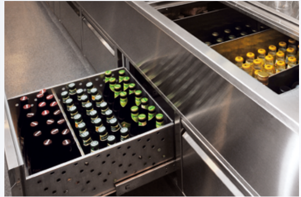
Optimal storage volume with full extension drawers for ergonomic access and top loader.