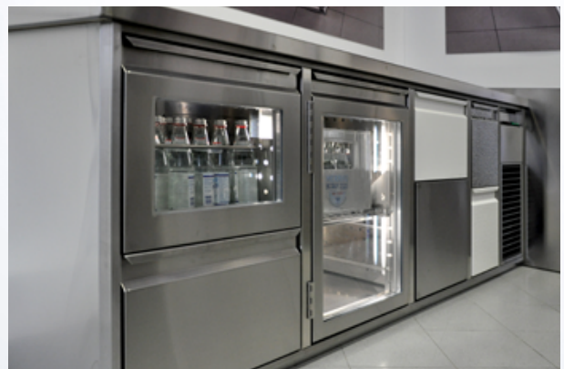
Combine different drawer heights and refrigerated with non-refrigerated elements.